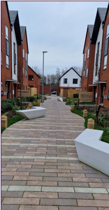
The alleyway between Grantley Close and Queens Drive in Park South.

Changing the focus a little, I also acknowledge that our familiar surroundings are also altered by the addition of new things, such as all the new electric charging stations that are appearing in nearly every supermarket car park and even on the corners of streets in the town centre. These are now part of the new world we live in and, not only are they here to stay, but they will probably become more prevalent as time goes by and electric vehicles become the norm.