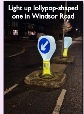
Light up lollipop-shaped one in Windsor Road