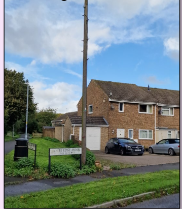
White Edge Moor

mail would not all fit on a postie's pushbike. In case you didn't already know, these boxes were filled by a Royal Mail van driver at the beginning of a working day with bags of mail and parcels for that particular round. The postie delivering in that area on their pushbike could then refill their pouch by going back and forth to the grey boxes enabling them to complete the whole delivery in that